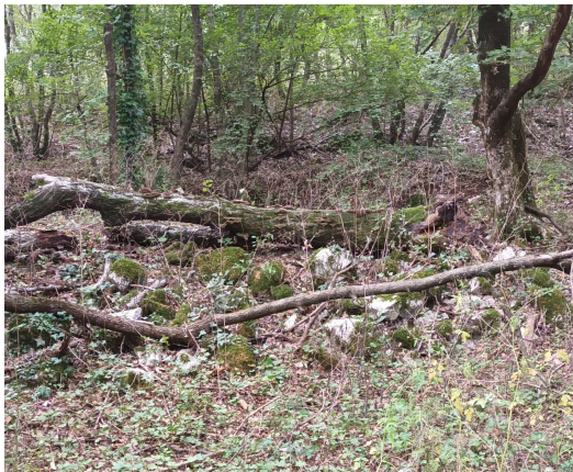
Low wall on the terrain