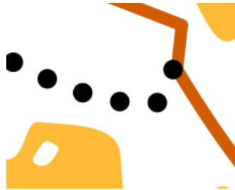
Low wall marked on the map

Low walls: In various parts of the map there are some low walls, marked on the map with the limit of vegetation symbol(416) like the following image: